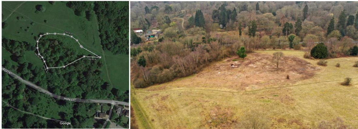
Image: Creating calcareous grassland. This area will transition within 5-10 years.

Dry weather in the winter enabled the team to commence scrub clearance and approximately 5,700 square meters of scrub was cleared on Park Downs to extend and restore the grassland. It will take this area between five to ten years to transition to rich calcareous grassland.