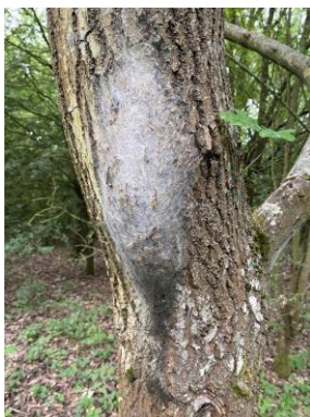
Image: Oak processionary moth nest

Ash Die-Back is widespread on Banstead Commons. Due to the escalating costs, as legal landowners, Reigate and Banstead Borough Council has stepped forward to support the removal of trees that are situated in areas of high risk along boundaries, footpaths and bridleways.