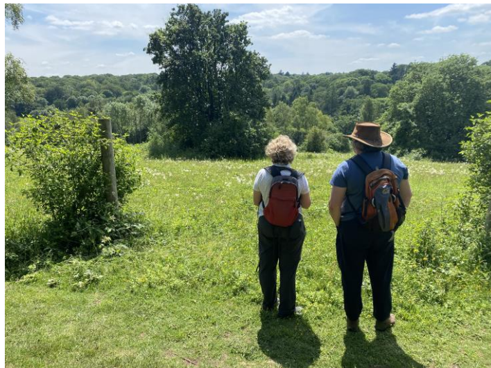
Image: Representatives from Natural England looking over Park Downs.

We have now completed our ten-year Higher Level Stewardship agreement with Natural England which consisted of an agreed programme to improve and maintain certain aspects of the common such as the quality of chalk grassland on the Downs and regeneration of heather and control of bracken on Banstead Heath. Representatives from Natural England visited Banstead Heath, Park Downs and Banstead Downs in June. To quote “Banstead Heath is simply spectacular” and Park Downs, which are units four and seven of the Chipstead Downs Site of Special Scientific Interest (SSSI), was awarded the Favourable Conservation Status in the assessment. Natural England invited the Conservators to apply for a twelve-month extension which was accepted with appreciation.