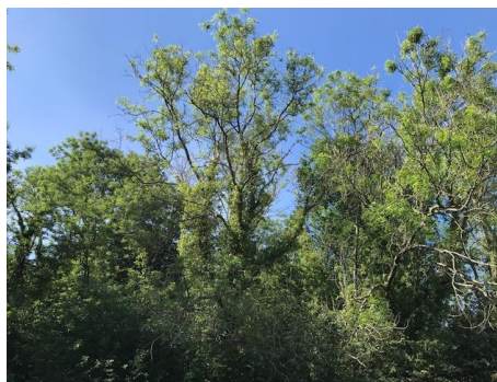
Image: Picture of the canopy on an Ash at Banstead Heath