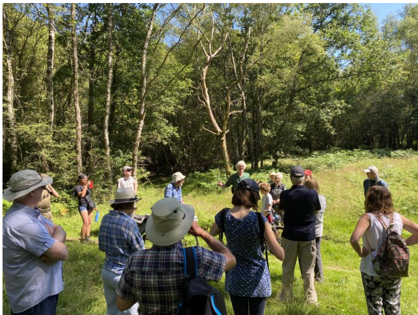
Image: Guided walk on the History & Countryside management of Banstead Heath

Fly tipping and litter persists across all four sites.